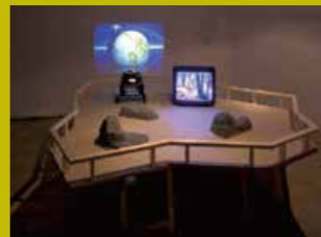
Contact Zone, 2008, Zagreb, Croatia, Almut Rink